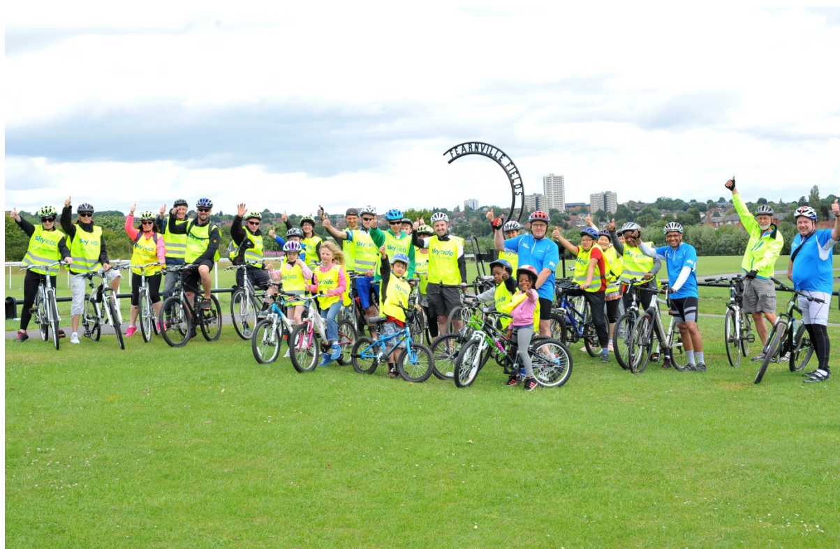
Picture – shows participants at a Fearnville Sky Ride Local Ride (2015).

Cycling organisation 'Cycle Pathways' are operating a popular and successful Bike Hub / Training Centre from the Fearnville Leisure Centre site in East Leeds.